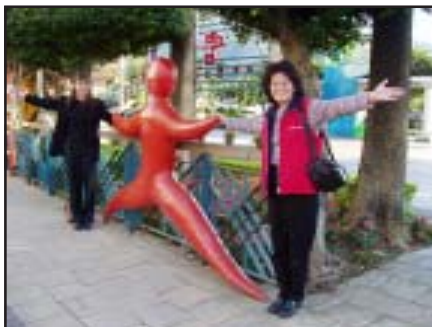
KIDS EE logos were dancing in the park across from the church, much to everyone's delight!