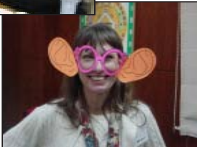
Big ears and glasses are made so that we remember to LISTEN and LOOK at what God says in Scripture, what we say to each other, and to what the children are saying to us.