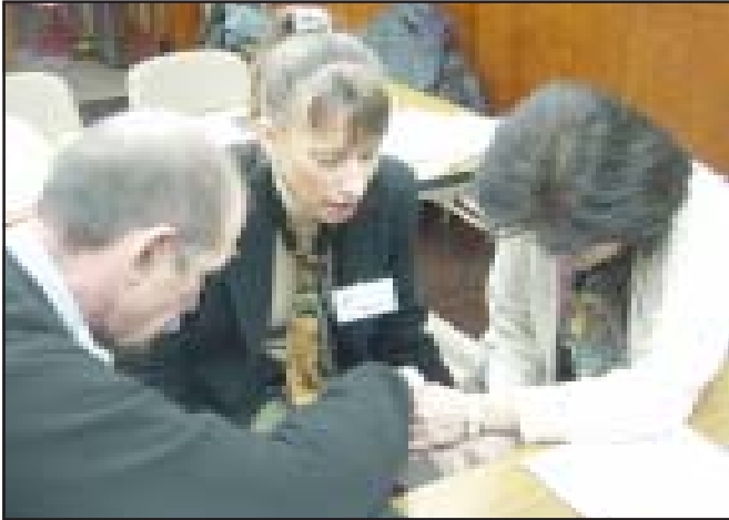
The U.S. team knows that success depends on prayer.