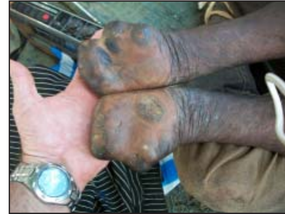
Holding the hands of the UNTOUCHABLES with the love of the Savior, where an unbelievable 2% of the population still suffer with leprosy.