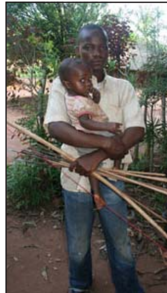
This ARROW BOY holds his baby daughter, ready to protect her with the only weapon he has, his bow and arrows.

The ARROW BOYS, young men and boys who together began defending and guarding their families and homes in the Refugee Camps when no other help arrived. Amazingly, using just homemade weapons against the LRA terrorists armed with AK 47's and missile-launched weaponry, the LRA have been routed when the civilian ARROW BOYS chose to stand together and defend their families.