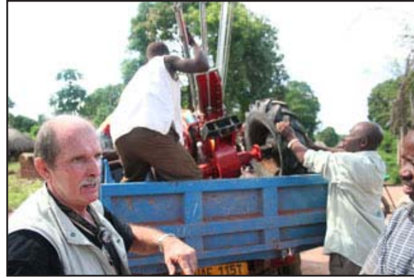
Averting starvation, EMI brings hope and help with seven tons of seed, 1,000 garden tools, and four walking tractors to help refugees help themselves after being driven from their homes in 2009 by LRA terrorists in the Western Equatoria region of South Sudan.