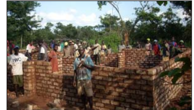
Even amid the crisis of the LRA's disruption, EMI continues the launching of two more Christian radio station to broadcast the Good News. The one pictured above is outside Doruma, DR Congo where the only communication has been tribal drums.