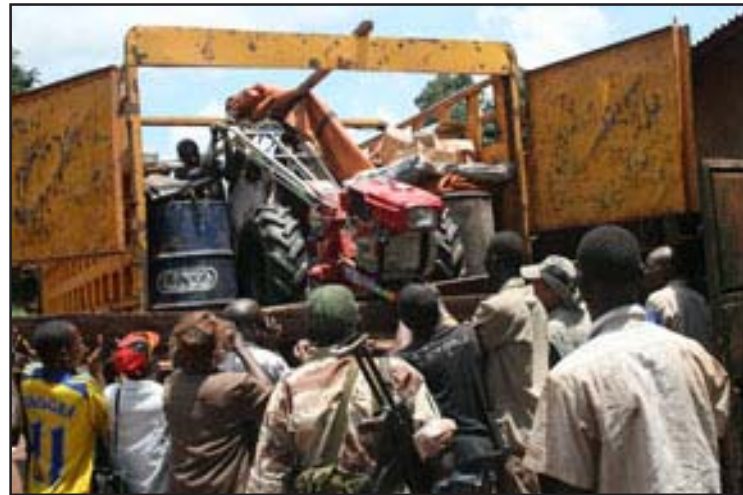
Delivery and distribution of much needed seeds, tools, and gardening implements to help those displaced from their homes in Ezo, South Sudan. Malaria medication, mosquito nets, water filters, soap, clothes, and other necessities were also brought in by EMI to be distributed to all the people in the name of Christ.