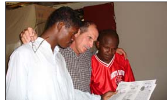
A few days before the end of 2009, word reached EMI that the Community Christian Radio Station in Ezo, South Sudan is being used as a staging site where LRA seeking amnesty are brought for debriefing. They are allowed to speak on the radio, in Acholi (the tribal language of the LRA) to those still with the terrorist group, telling how they are not being harmed by the UPDF soldiers and others also could surrender and seek asylum. This is a direct answer to much fervent prayer for the disbanding of the LRA.