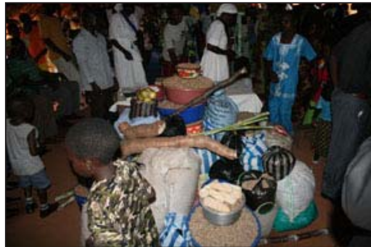
Like the Macedonian church (II Corinthians 8:1-3), this Sudanese church brings their tithes and offerings to be distributed among those in the refugee camps who are in even greater need than they.

The ARROW BOYS, young men and boys who together began defending and guarding their families and homes in the Refugee Camps when no other help arrived. Amazingly, using just homemade weapons against the LRA terrorists armed with AK 47's and missile-launched weaponry, the LRA have been routed when the civilian ARROW BOYS chose to stand together and defend their families.